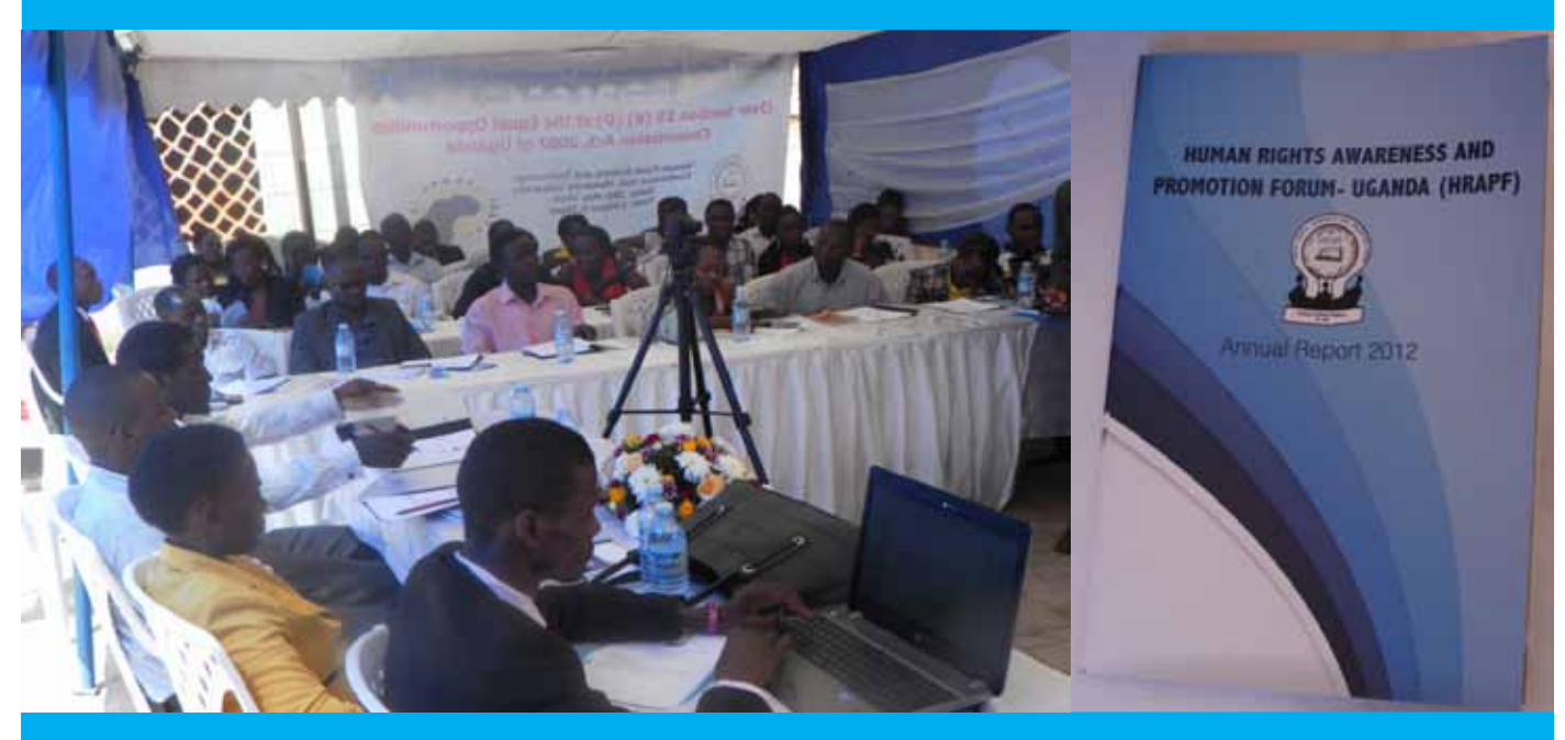
HRAPF members recieive the HRAPF Annual Report 2012. Right, the outlook of HRAPF Annual Report 2012 unveiled during the fourth HRAPF Annual General Meeting on 27th July 2013 at the Secretariat

HRAPF's Annual Report for the year 2012 has been published. The report was unveiled during the 4<sup>th</sup> Annual General Meeting held on 27<sup>th</sup> July 2013 at the organisation's secretariat.