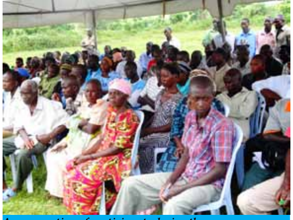
A cross section of participants during the awareness session on land in Mubende District.