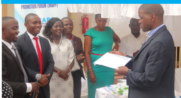
HRAPF staff introducing themselves to HRAPF Members