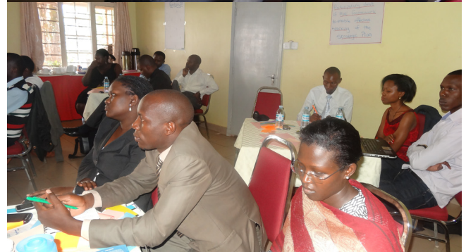
Above HRAPF staff during the monitoring and evaluation training workshop at Namirembe Guest House and below is one of the slides of the training.