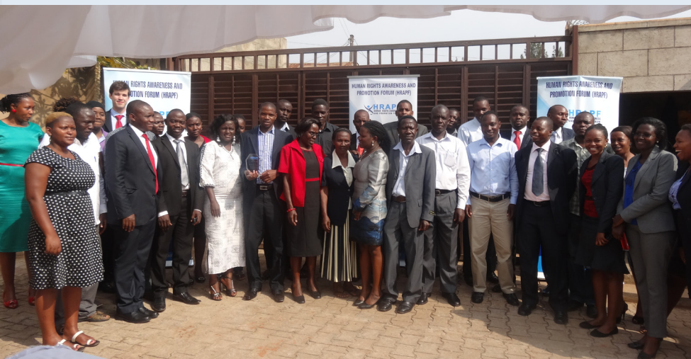
HRAPF elects new Board of Directors