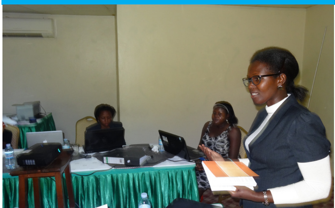
HRAPF Lawyer facilitating the training