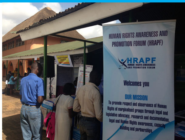
HRAPF staff displays information about human rights at Hotel African during the exhibition to celebrate the 20th Anniversary of Human Rights Network- Uganda (HURINET)

Activities such as these have always helped HRAPF to showcase its work and interact with the members of the public and other stakeholders on the rights of marginalized groups in Uganda.