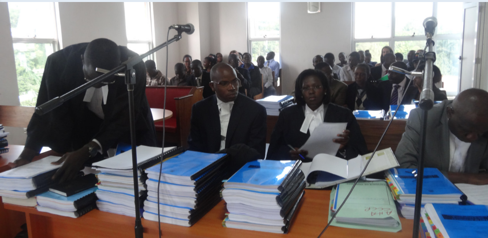
HRAPF's Fifth Annual General Meeting

Uganda's Anti-Homosexuality Act 2014 annulled.