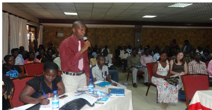
Above, a participant asking a question and below, HRAPF staff exhibiting information materials