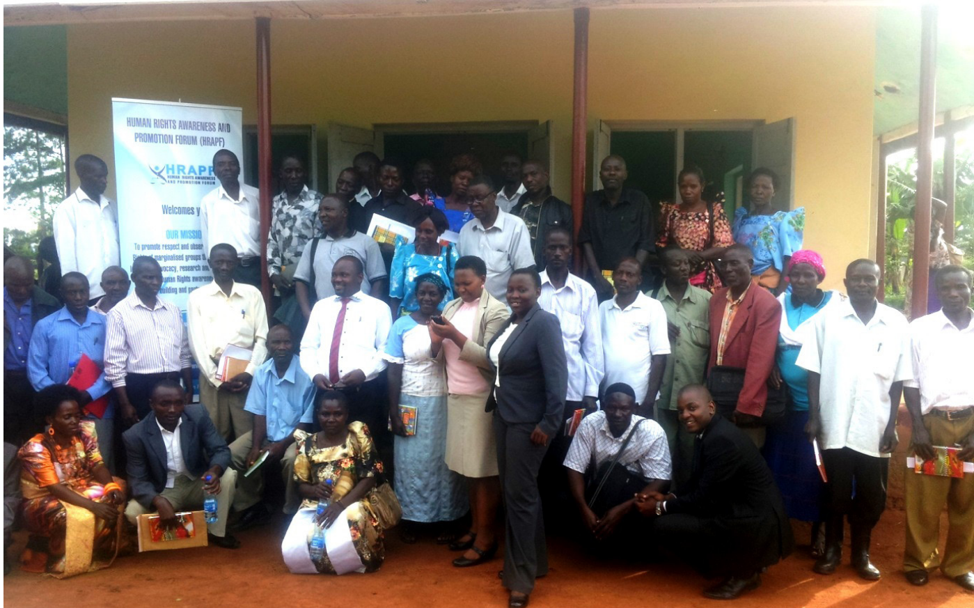
LC1 Chairpersons in Masuliita pose with HRAPF Lawyers in a group photo after training at Masuliita Sub County Hall

After implementing the Land Project for two years in Wakiso District, HRAPF learnt that one of the reasons why the Local Council (LC) officials do not adequately handle land issues is simply because they do not know how to do it. HRAPF therefore decided to empower them with the knowledge to work on these cases and resolve disputes.