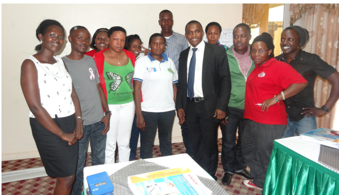
Trainees in a group photo with the Executive Director

The beauty of training paralegals is the ability of the trained paralegals to reach the grass root people who desperately need legal aid that HRAPF's legal aid clinic cannot reach directly. Paralegals are trained from community members themselves, who are well aware of the types of challenges people face. In a period of six months from January-June 2014, HRAPF's trained paralegals identified, handled and referred 143 cases for marginalized people. This is what gives meaning to the paralegal training project.