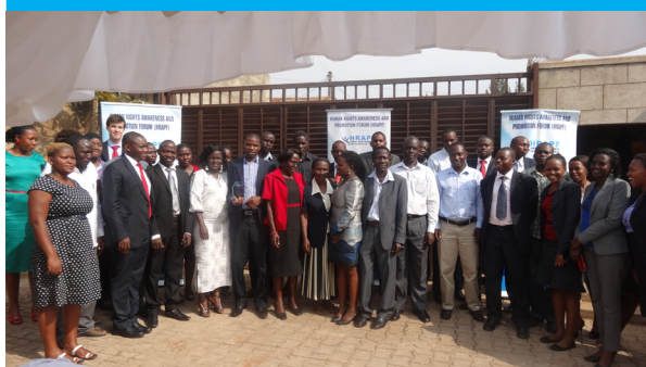
HRAPF members and staff in a group photo