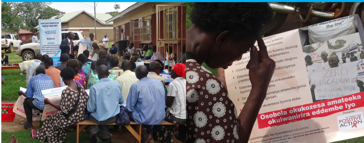
HRAPF project officer facilitating at the session in Mityana