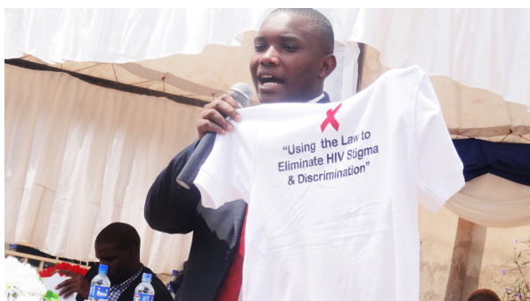
HRAPF Executive Director displaying the work HRAPF does to members at the AGM