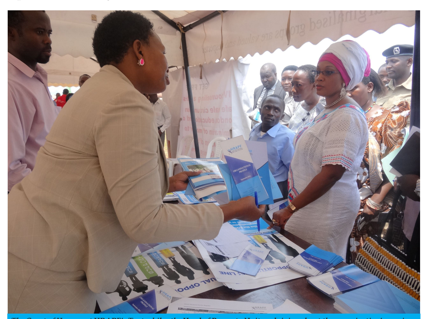
The \ Guest \ of \ Honour \ at \ HRAPF's \ Tent \ whiles \ the \ Head \ of \ Property \ Unit \ explaining \ about \ the \ organisation's \ services.

HRAPF released a press statement on women's day in the Observer of 9<sup>th</sup> March 2015. The press statement was titled Make it happen; enact laws that ensure equality for women.