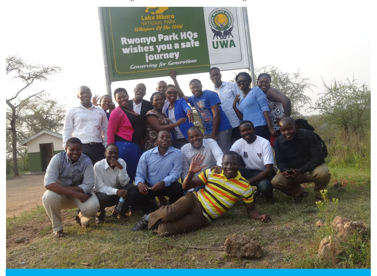
HRAPF staff tour Lake Mburo National Park during the begining of year staff retreat and training in Mbarara in January 2015.

By the end of the retreat, HRAPF staff had been trained in different skills that would improve their effectiveness at work, and had also had fun. People left the beautiful hills of Mbarara energised and revitalised to start work for the New Year.