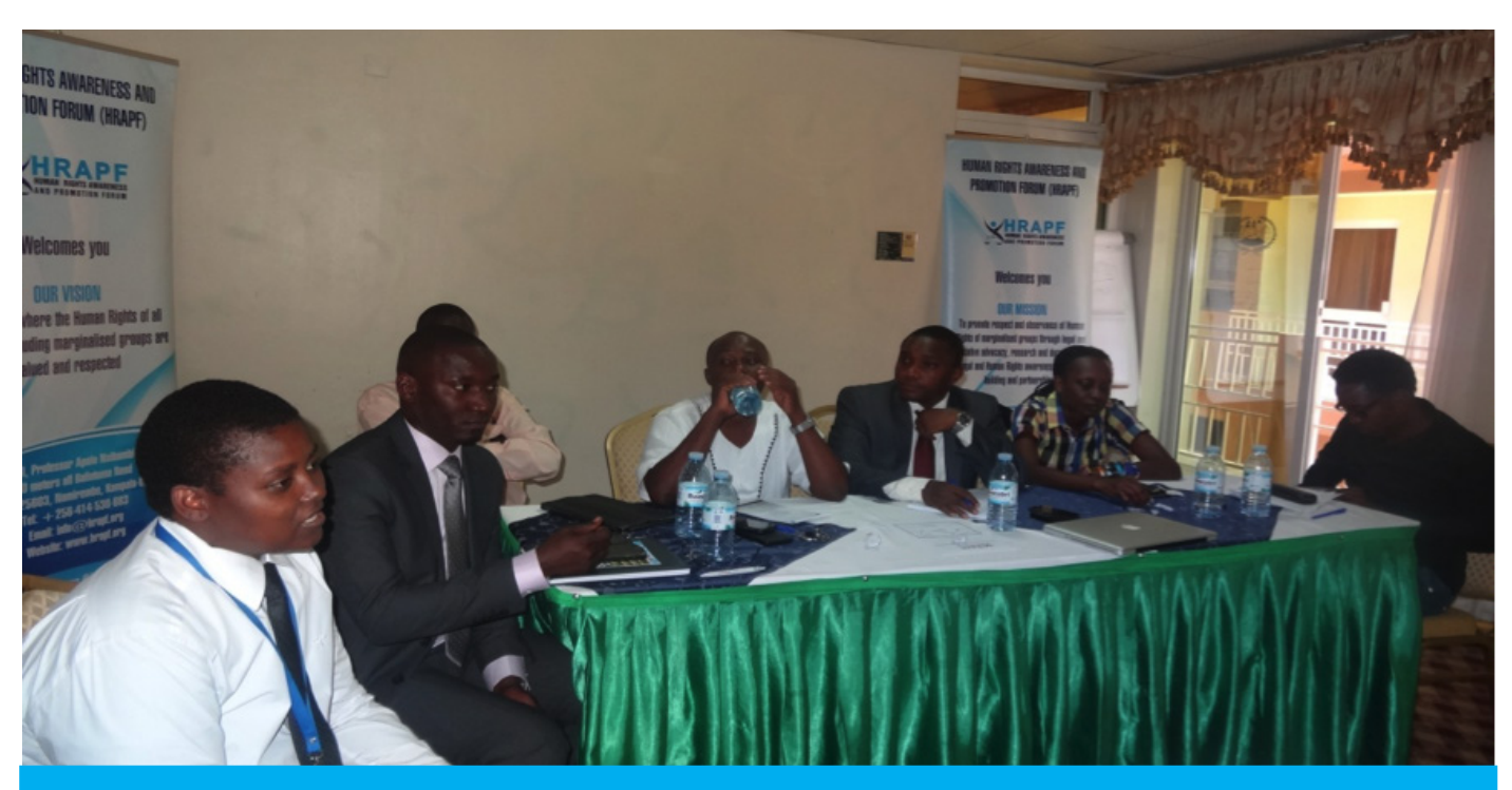
HRAPF Lawyers attending a refresher course in LGBTI issues at Rider Hotel Seeta

Uganda. A task force that properly understands the uniqueness and vulnerability of this community.